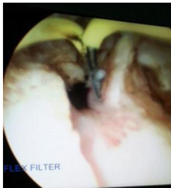
Fig. 2: Endoscopic incision give with Collins knife karl storz