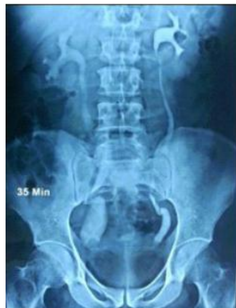
Fig. 1: Right side ureterocele present.

All three cases were under treatment by alpha blockers and antibiotics from a very long time but no successful results were found. A small surgical intervention was the key to their successful recovery and a comfortable life without any medications whatsoever.