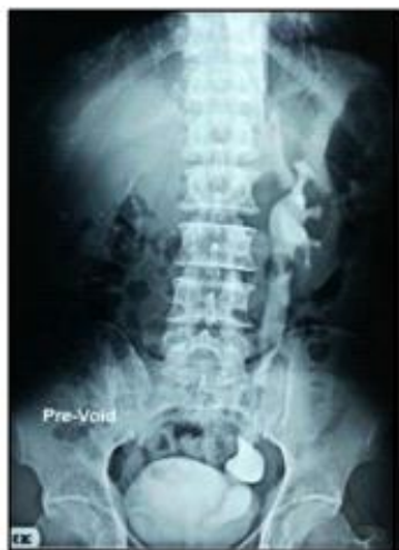
Fig. 3: Fusiform ureterocele present on left side