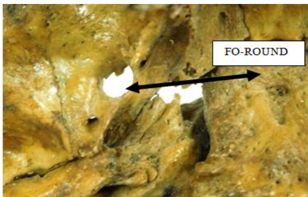
Fig. 2: FO-Round shaped