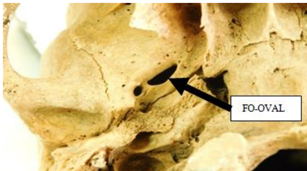
Fig. 1: FO- Oval shaped

We observed morphological variants of FO like round (9%) and oval (91%) on right side and on left side it was oval in 89% and round in 11% respectively (Table 4). FS was in round shape in 100%. In the present study, Emissary sphenoidal foramen were observed in 10 cases- 6 on right and 4 on left side of skulls (Table 3).