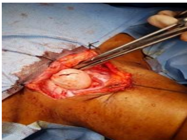
Fig. 1: Intra-Operatively showing cystic mass occupying the left supraclavicular region

Thoracic duct cysts diagnosed post-mortem, the first by Enzmann in 1883. 1,2 Tsuchiya et al (1980) reviewed eight cases described since 1950 and added one case which they believed to be the first diagnosed before thoracotomy. 2