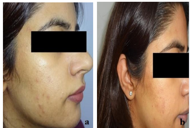
Fig. 2: Clinical improvement in acne scars following fractional CO 2 laser only group, showing: a) Ere treatment, b) Later treatment