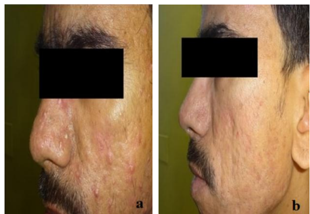
Fig. 5: Clinical improvement in acne scars following fractional CO 2 laser treatment with high-dose isotretinoin, showing: a) Ere treatment, b) Later treatment