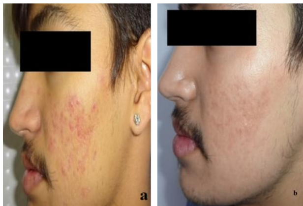
Fig. 4: Clinical improvement in acne scars following fractional CO 2 laser treatment with medium-dose isotretinoin, showing: a) Ere treatment, b) Later treatment