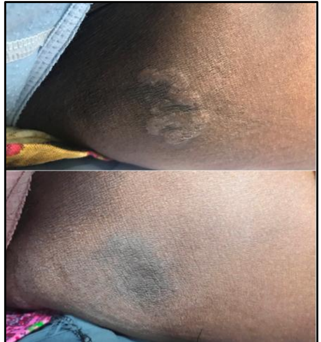
Fig. 3: Sertaconazole topical therapy showing improvement at the end of 3 weeks