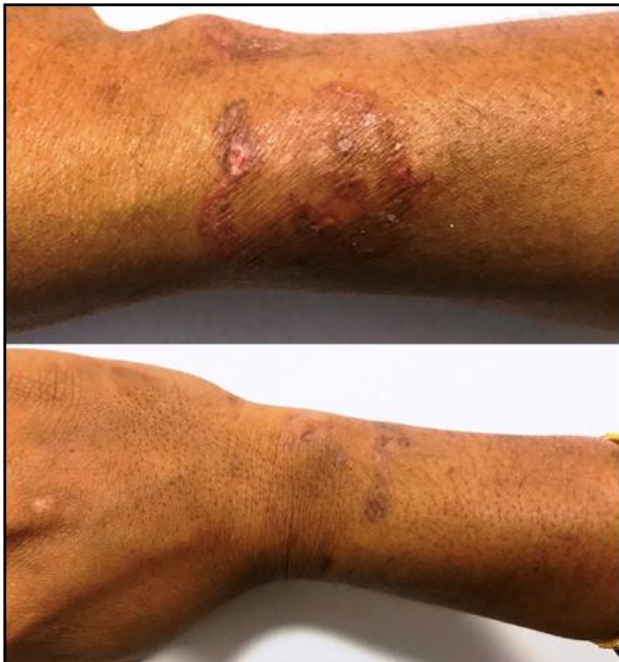
Fig. 1: Amorolfine topical therapy showing improvement at the end of 3 weeks