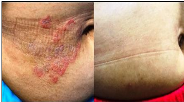
Fig. 2: Luliconazole topical therapy showing improvement at the end of 3 weeks