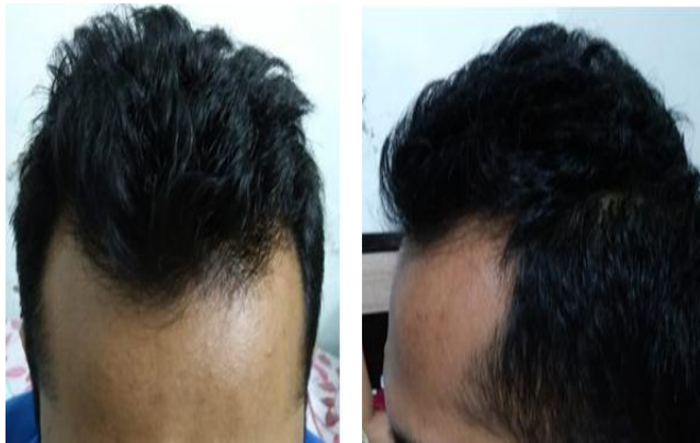
Grade 3: Vertex