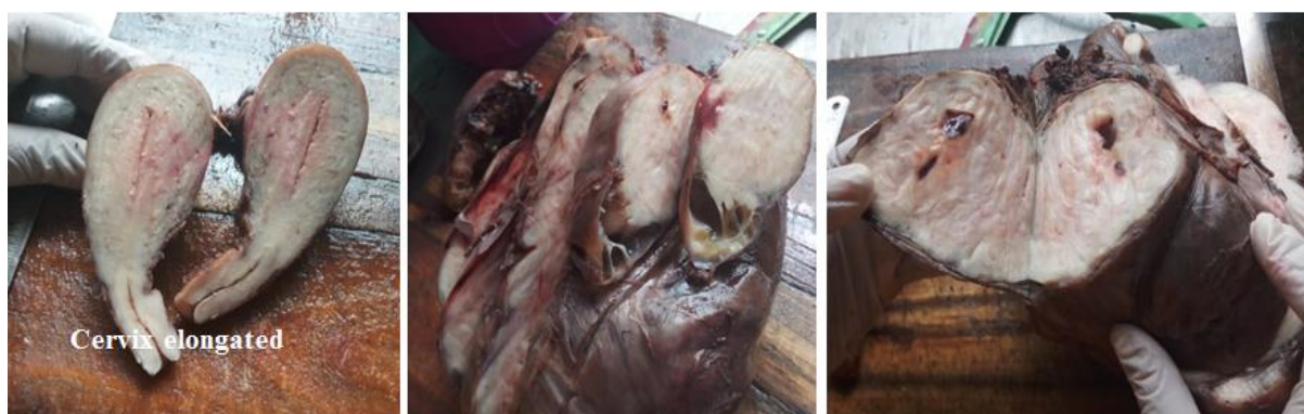
Fig 3: Cut sections of Uterus and fibroid specimens showing cystic degenerations and hemorrhages

Broad ligament fibroids are of two types either a uterine tumor which grows into the broad ligament known as false broad ligament tumor but it preserve uterine attachments. Or a primary also known as true broad ligament leiomyoma arising from the sub peritoneal connective tissue of ligaments. 1 True broad ligament tumors lie lateral to ureter and uterine vessels. Whereas false tumor always lies medial to it. 1 In our case fibroid arise from lateral wall of uterus on left side and it occupied almost entire pelvis and altered uterus position so it is a false broad ligament fibroid. Based on location of the fibroid patient presents with varies symptoms. In our case patient presented with abdominal discomfort due to huge fibroid and menorrhagia. The differential diagnosis for broad ligament leiomyoma includes benign or malignant ovarian masses, broad ligament cyst, lymphadenopathy and tubo-ovarian masses. 1 In our case on clinical examination and ultrasonography it was suspicious of an ovarian mass or broad ligament leiomyoma. Further CA 125 levels came as normal. According to rajanna et al, 5 case report, broad ligament fibroid may associated with pseudo meigs syndrome with elevated CA 125 levels hence MRI plays vital role in differentiation of broad ligament fibroids from ovarian tumors. In general broad ligament fibroids are single with regular borders. In our case it is large bossolated mass.