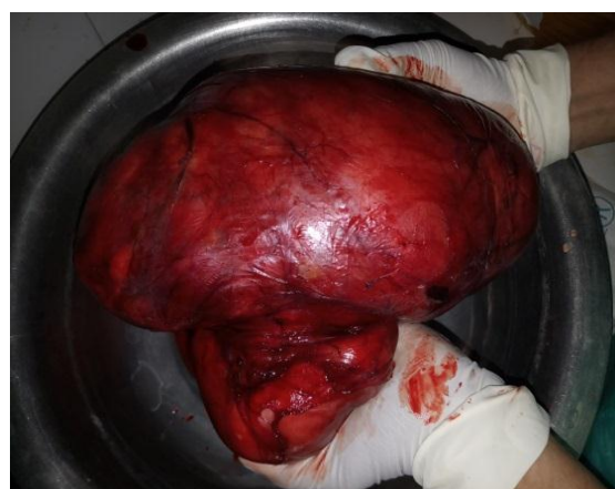
Fig. 2: Pseudo Broad ligament Fibroid specimen