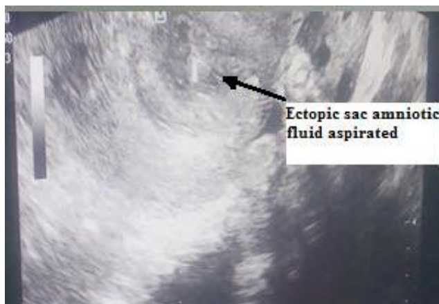
Fig. 3: Aspiration of amniotic fluid