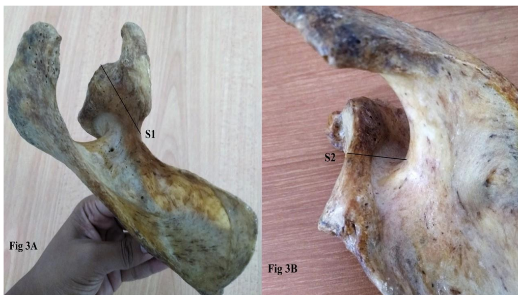
Fig. 3: Measurement of safe zone distance in scapula