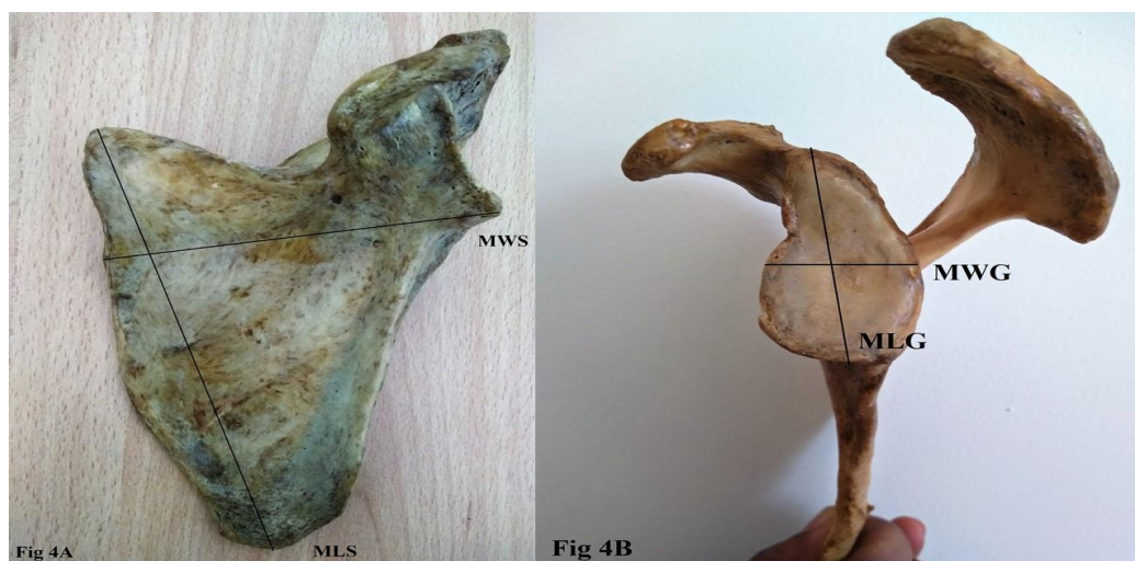
Fig. 4: a) Measurement of maximum length and maximum width of scapula; b): Measurement of maximum length and maximum width of glenoid cavity