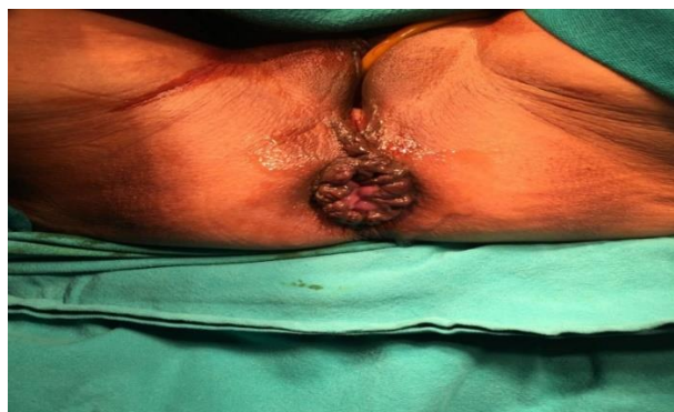
Fig. 1: A case of grade III haemorrhoids

MIPH was performed under SA (Spinal Anaesthesia) with patient in lithotomy position. Patients were re-examined under Anaesthesia to confirm the grade of haemorrhoids and to rule out associated anal pathologies like anal fissure and fistula-in-ano (Fig. 1).