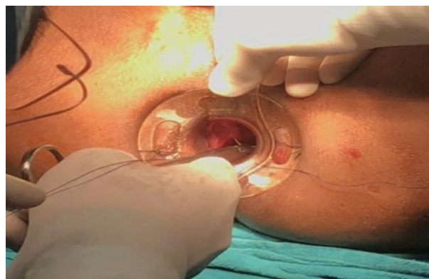
Fig. 3: Purse-string submucosal sutures

A purse-string suture with 2-0 Prolene was taken approximately 4 cm above the dentate line. Only the mucosa and Submucosa was taken during Suturing. Once purse-string was completed circumferentially, the suture Anoscope was removed from the circular Anoscope (Fig. 3).