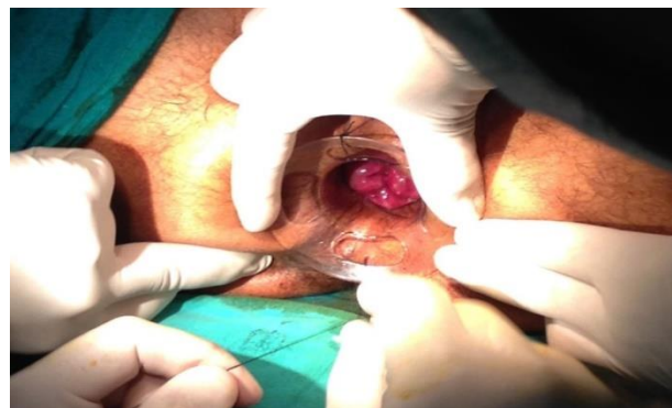
Fig. 2: Fixation of transparent circular anoscope

A 33-mm circular stapling device 'PPH-33 Kit' which contains a Stapler gun, circular transparent anoscope, anal dilator, a purse-string transparent slit Anoscope, suture passer and 2-0 polypropylene suture. The anal sphincter was progressively dilated to three fingers with the help of anal dilator and the transparent circular Anoscope is inserted and fixed with perianal skin using silk suture which allows visualization of the dentate line at all times (Fig. 2).