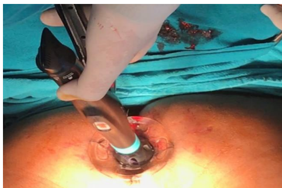
Fig. 5: Stapler device fired

of the stapler and tied over the device thus giving a gentle traction. The stapler was advanced into the anal canal, such that the 4 cm mark on the head of the stapler was at the level of the anal verge, and the stapler head was tightened. Care was taken to keep the stapler in the same axis as the long axis of the anal canal to avoid deforming the anal canal. When fully closed, the stapler was fired and held closed for 45 seconds to aid Haemostasis (Fig. 5).