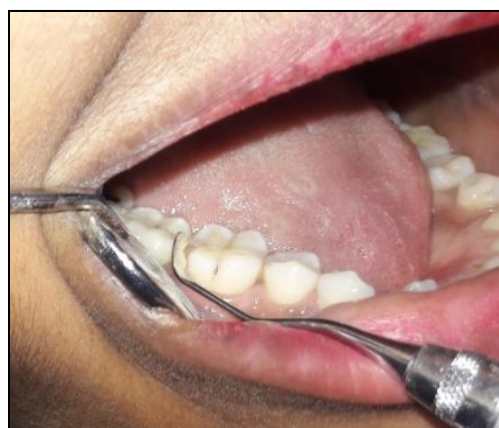
Fig. 2: Collection of plaque sample from the site