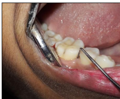
Fig. 1: 4 – 6 mm of probing depth

All the data was collected and analyzed. The statistical analysis was done by statistical software SPSS version 16.0. The descriptive statistic mean and SD of different parameters at different time interval of two groups were calculated, the significance of mean, mean difference of a parameter at 2 intervals was tested by t-test for two independent groups. Since CFU in two groups at pre and post have high standard deviation, so the data for CFU transformed in Logarithm base 10 and log transformed t test has been used. The confidence interval and level of significance were 5% and 95% respectively.