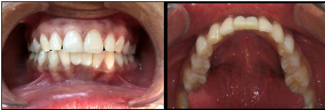
Fig. 3: Final intraoral view of the finished bridge