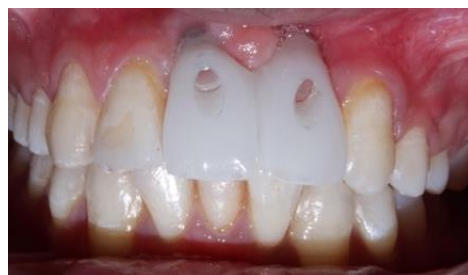
Fig. 7: Intra-oral trial of polymethyl methacrylate crowns