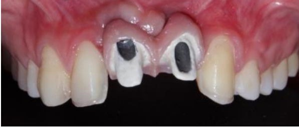
Fig. 10: Laminate preparation on 12, 23 and trial insertion of screw-retained framework

Laminate preparation on 12 and 23 was done using Gurel’s technique to ensure a conservative preparation and a final impression of the prepared teeth along with the titanium framework was made in polyether impression material (Impregum; 3M ESPE).