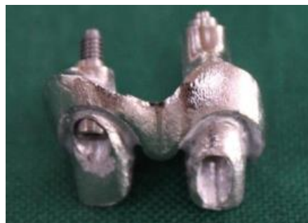
Fig. 8: Definitive titanium framework

Once the alterations were made, the screw-retained, definitive titanium framework was milled using computer aided manufacturing and verified intra-orally. Subsequently, the gingival aspect of the framework was layered with pink ceramic in addition to application of an opaquer over the abutments.