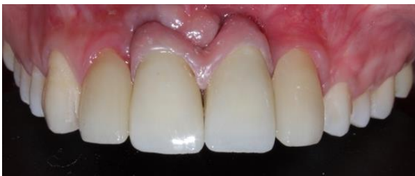
Fig. 12: Intra-oral view of definitive Paulo Malo prosthesis and laminate veneers

The zirconia crowns were cemented with a resin reinforced glass ionomer cement (Fuji Cem, GC) and the laminates with a resin cement (Calibra).