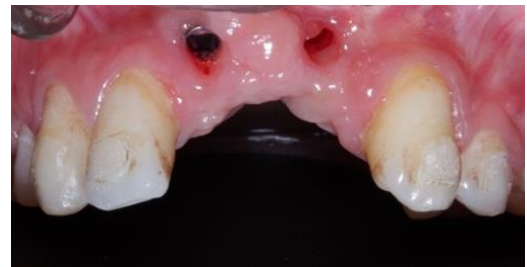
Fig. 1b: Intra-oral pre-treatment occlusal view

On further examination, the implants were osseointegrated with a severe labio-palatal angulation, increased subcrestal depth (5mm in the 21 region) and compromised position. Hence the patient was given the following treatment options: