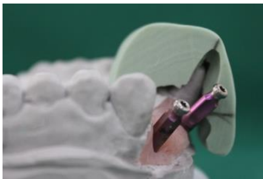
Fig. 4: Buccally tilted implant angulation. Note – correct tooth angulation depicted by the putty index.

Once the alterations were made, the screw-retained, definitive titanium framework was milled using computer aided manufacturing and verified intra-orally. Subsequently, the gingival aspect of the framework was layered with pink ceramic in addition to application of an opaquer over the abutments.