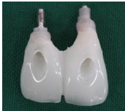
Fig. 6: Polymethyl methacrylate trial