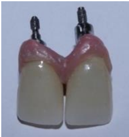
Fig. 11: Definitive prosthesis

Thereafter, the ceramic of the various parts of the definitive prosthesis were glazed. The abutment screws were tightened to a torque of 30N, followed by blockage of the screw-access hole with gutta percha and composite resin.