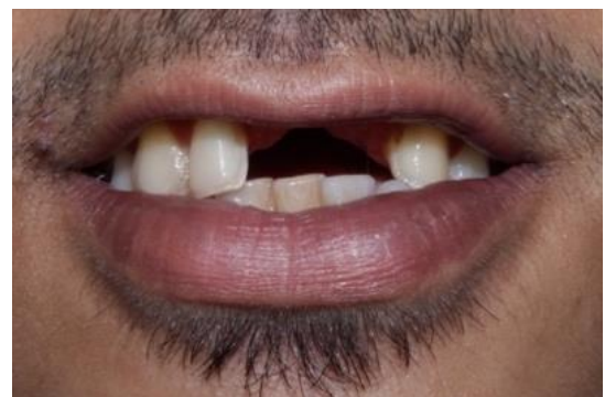
Fig. 15: Pre-treatment smile