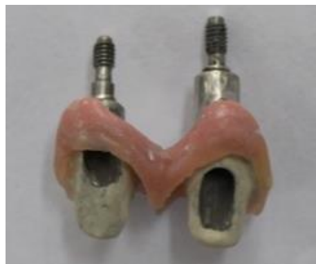
Fig. 9: Ceramic soft tissue moulage on the titanium framework

On approval of the design, a polymethyl methacrylate trial was 3D printed and checked intra-orally for any modifications. Care was taken to ensure a correct angulation of the abutments along the contour of the maxillary arch in addition to a satisfactory level of the gingival zeniths and extra-oral lip support.