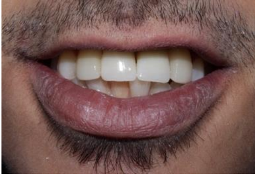
Fig. 16: Post-treatment smile.