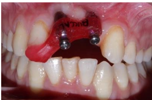
Fig. 3: Trial of verification jig