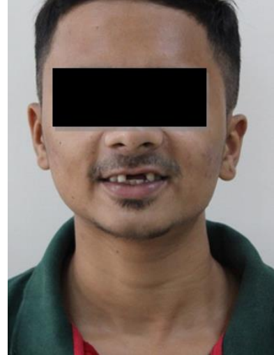
Fig. 13: Pre-treatment extra-oral view

The zirconia crowns were cemented with a resin reinforced glass ionomer cement (Fuji Cem, GC) and the laminates with a resin cement (Calibra).