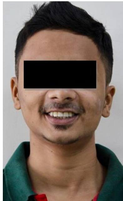
Fig. 14: Post-treatment extra-oral view