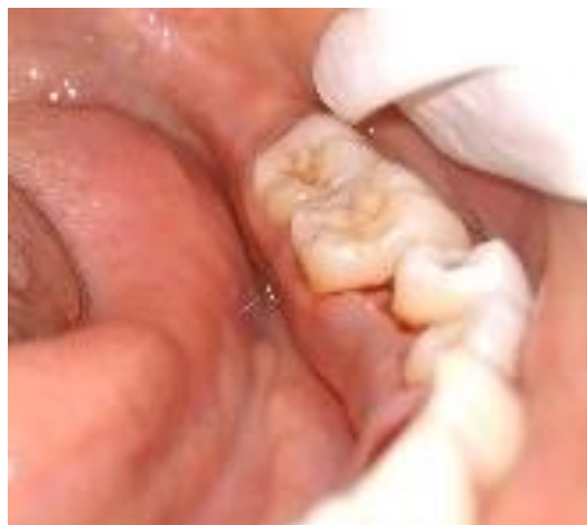
Fig. 7: Post operative view lingual aspect of left mandibular gingiva after gingivectomy