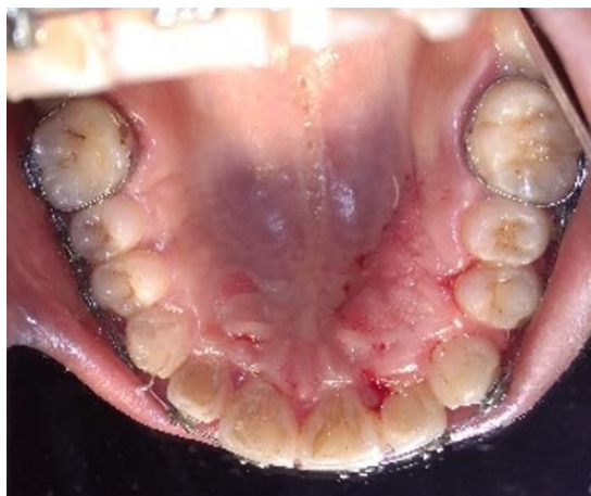
Fig. 10: Post operative view of left maxillary gingiva after 6 months