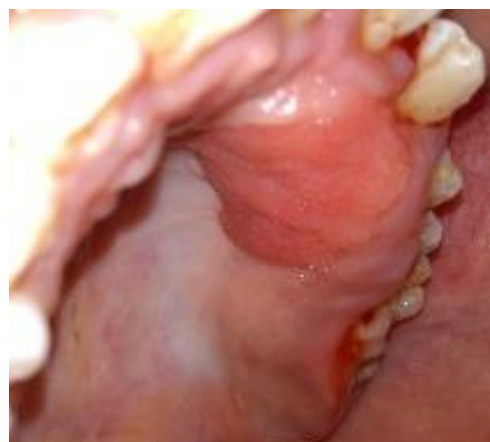
Fig. 3: Enlarged maxillary palatal mucosa showing a erythematous lesion in relation to canine & 1 st premolar