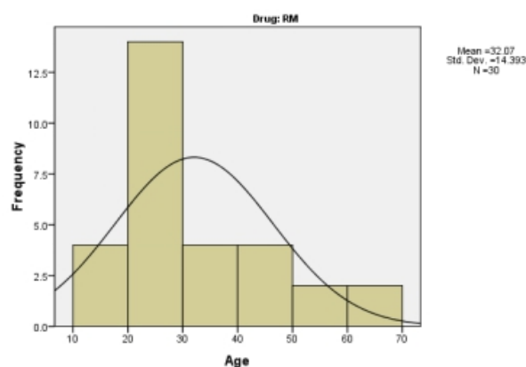
Fig. 1: Descriptives of pain score for all the patients across 6 hours in the two treatment groups

The two Groups were comparable in terms of age, sex and weight