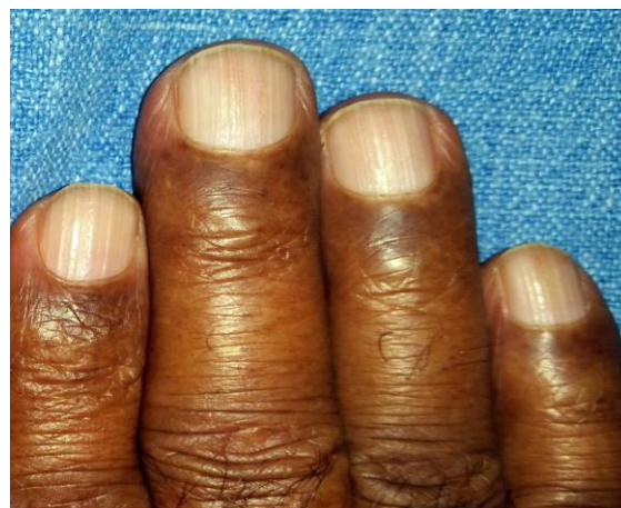
Fig. 3: Onychorrhexis