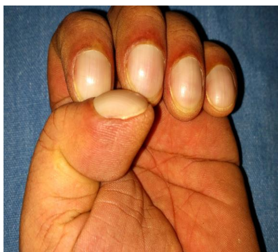
Fig. 2: Clubbing