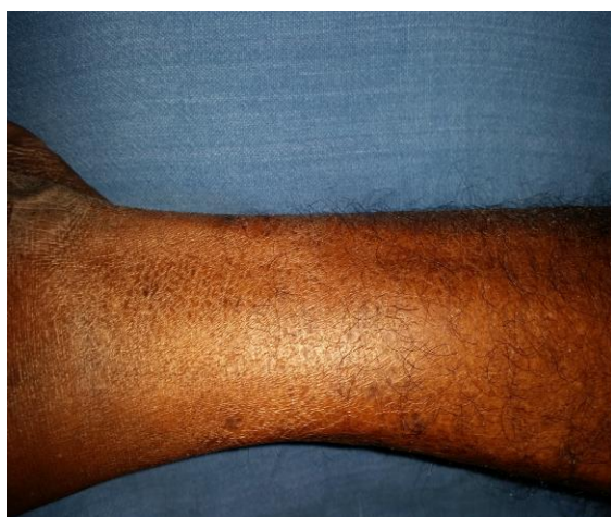
Fig. 1: Xerosis