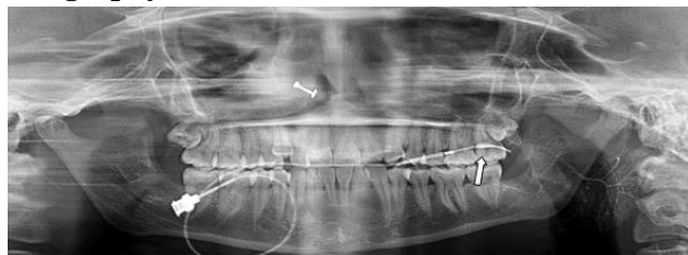
Fig. 5: Orthopentamograph showing mucous plug in the proximal portion of stensons duct