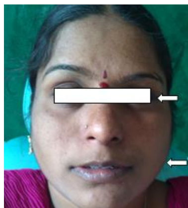
Post-Op follow-up photograph