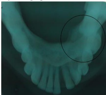
Fig. 2: Occlusal radiograph