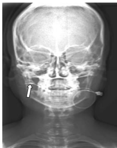
Fig. 6: PA view of skull