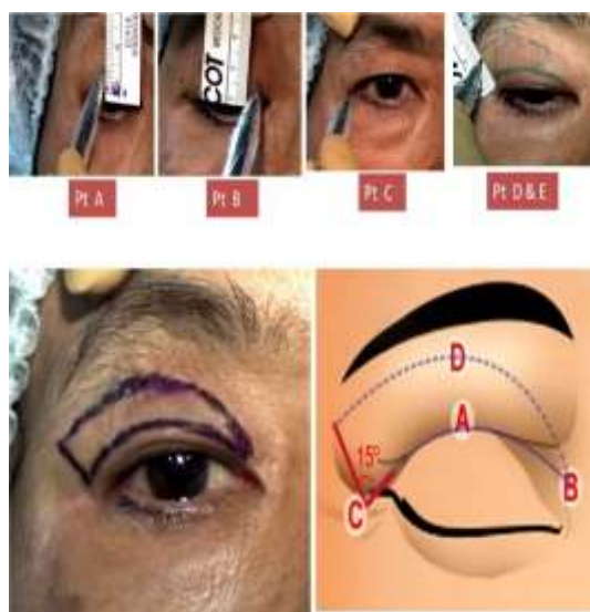
Fig. 1: Authors technique of eyelid markings for UEB

In same sitting, the ROOF is repositioned back for restoring the eyebrow volume along with its internal fixation at desired position i.e. 2-3 mm above the supraorbital rim, with two non-absorbable sutures. The orbicularis muscle is closed with interrupted 6-0 absorbable sutures. A trademark suture 'K-suture' (5-7, interrupted, horizontal mattress) is applied taking the pretarsal skin, orbicularis oculi muscle, LPS fibres and skin, to create a prominent and desired eyelid crease(Fig. 3h). The skin is then approximated with continuous or interrupted, preferably non-absorbable sutures(8-0 prolene)(Fig. 3i). One may encounter 'dog ears' at the temporal ends and the Burow's triangle can be a good option for closing keeping the curve superiorly concave. The scar should not extend beyond the line joining lateral canthus and temporal end of eyebrow to avoid its visibility in primary gaze. Antibiotic ointment is applied with sterile dressing. The authors strongly recommend the use of small ice packs (preferably sterile) over the dressing to reduce the edema, enhance patient comfort and providing tamponade. The head end of the patient is raised and bilateral eye patching is recommended for 4-6 hours followed by patients' choice for its removal.