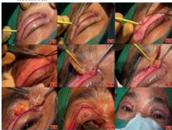
Fig. 3: Surgical Steps