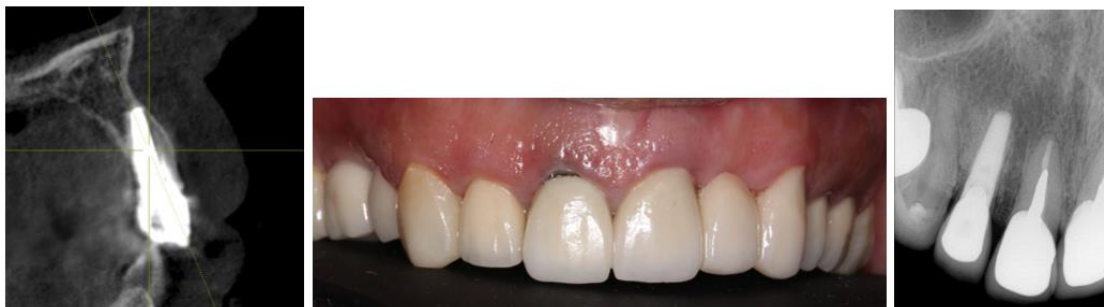
Fig. 4: 3 years follow up

The clinical and radiographical assessment revealed, that retaining root fragment adjacent to the buccal crestal bone and placing an implant engaged to the palatal socket wall immediately are able to maintain the contour of the ridge without an interference with the osseointegration for 3 years post loading. 11