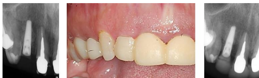
Fig. 2: Implant placement with provisional acrylic restoration