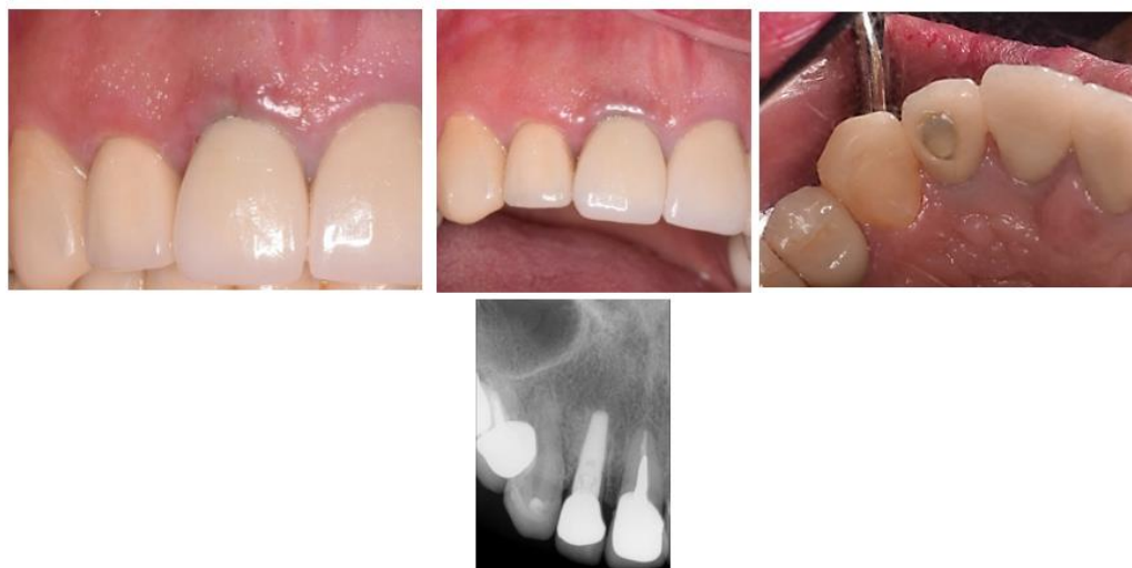
Fig. 3: Final restoration

For the postoperative instruction, patient was advised to rinse with 0.12% Chlorhexidine mouthwash two daily for two weeks. Nonsteroidal anti-inflammatory drugs (ibuprofen 400 mg four times daily for 3 days than as needed) and oral antibiotics (amoxicillin 500 mg three times daily for seven days) were prescribed after surgery.