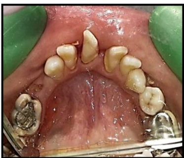
Fig. 2: Intraoral occlusal view of mandibular arch showing generalized spacing and malaligned teeth with missing 35, 44 & 45

On radiographic examination, FMX showed that the patient had root pieces of 14 and 45. Also, there was generalized horizontal alveolar bone loss which was severe (upto midroot level) in mandibular anterior region and less severe (within the cervical third of teeth) in maxillary and mandibular posterior regions. Also, there was generalized bulbous appearance of roots of almost all the teeth except 12,11,21,22,23,27,37,32,31,41,42 interpreted as generalized hypercementosis. [Fig. 3]