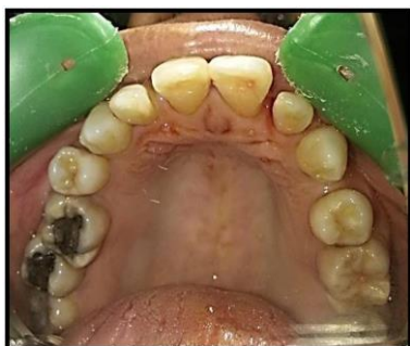
Fig. 1: Intraoral occlusal view of maxillary arch showing generalized spacing and malaligned teeth with missing 14, 25 & 27

On intraoral examination, there were all teeth present except 14, 25, 27, 34, 44 and 45. [Fig. 1 & 2] A signed informed consent was taken from the patient regarding the publishing of the photographs. There was pit and fissure caries in relation with 18, 28, 38, 47 and 48. Also there were generalized plaque and calculus deposits accompanied by generalized gingival recession and periodontal pockets with severe bleeding on probing. There was generalized spacing between all the teeth. The patient was advised full mouth set of intraoral digital full mouth radiographs (FMX) in order to evaluate the root condition and for planning the orthodontic treatment.