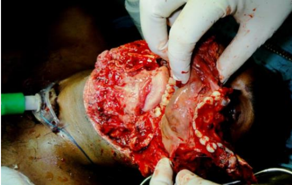
Fig. 1: Near total avulsion of lower jaw

lingual sulcus, and merges medially with under-surface of the oral tongue. It has a covering of delicate oral mucosa through which the thin walled sublingual/ranine veins are visible. The frenulum is a mucosal fold that extends along the midline between the openings of the submandibular ducts. The mylohyoid muscle forms the diaphragm of the mouth.