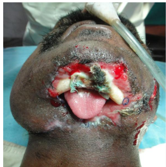
Fig. 6: Tongue protruding from orocervical fistula