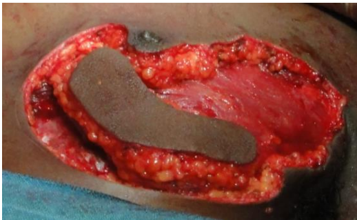
Fig. 9: PMMC harvesting