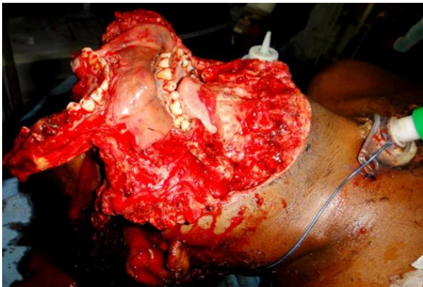
Fig. 2: Near total avulsion of lower jaw- preoperative