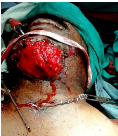
Fig. 10: Floor of mouth Reconstructed with PMMC