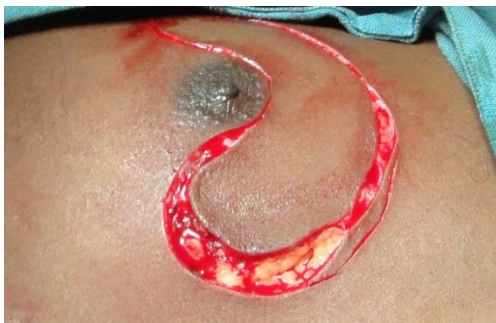
Fig. 8: Design of PMMC