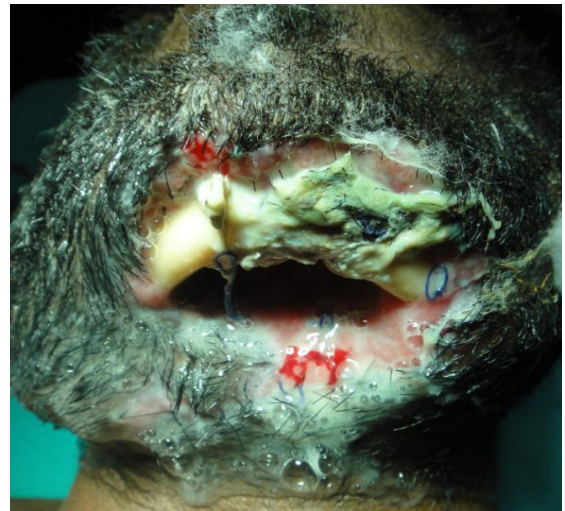
Fig. 5: Floor of mouth necrosed and lost