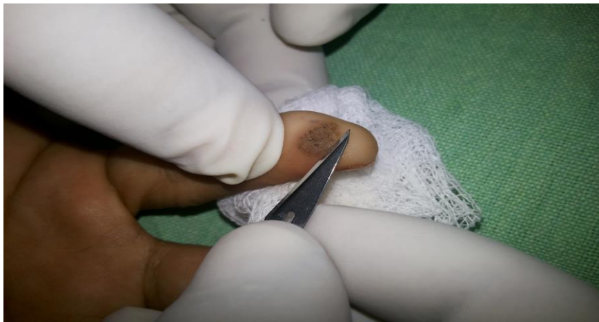
Fig. 1: Paring of wart tissue using 11 no. surgical blade