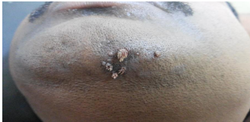
Fig. 4: Recurrent warts over the chin