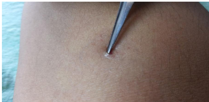
Fig. 3: Implanting the pared wart tissue deep into the sub cutis