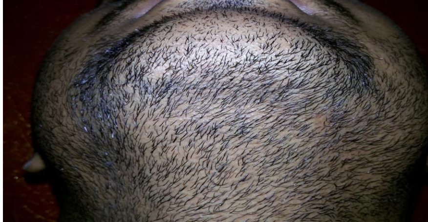
Fig. 5: Complete resolution of warts at the end of 3 months