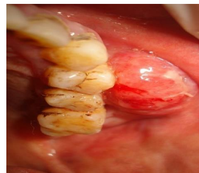
Fig. 1: Intraoral swelling in the left maxillary posterior region

continuous in nature. Past dental, medical and family history were non contributory. Extraoral examination revealed facial asymmetry in the left middle third of the face due to a diffuse solitary swelling measuring about 5 x 4 cms in size. Skin over the swelling was normal in colour and stretched. There was obliteration of the nasolabial fold. Watery discharge was seen from the left eye. On palpation the swelling was tender, firm in consistency and not fixed to the overlying skin. Intraoral examination revealed a well defined swelling in the left maxillary buccal vestibule which was dome shaped extending from left maxillary first premolar to left maxillary third molar region (Fig. 1). It was around 4x2 cms in size causing obliteration of the buccal vestibule. The overlying mucosa was erythematous and ulcerated. On palpation it was firm and tender. There was grade three mobility in relation to left maxillary second premolar and left maxillary first molar. Gingival recession was seen in the palatal aspect of left maxillary second premolar and left maxillary first molar.