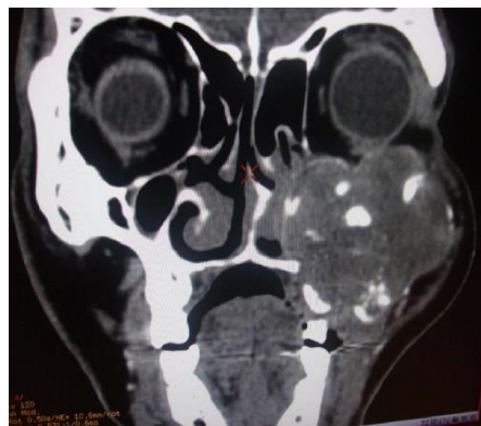
Fig. 3: Computed tomography scan (coronal view) revealed lobulated expansile lesion involving the left maxillary sinus, floor of the orbit, lateral wall of the nose with presence of multiple foci of calcification

every six months for follow up and no recurrence has been observed till date.