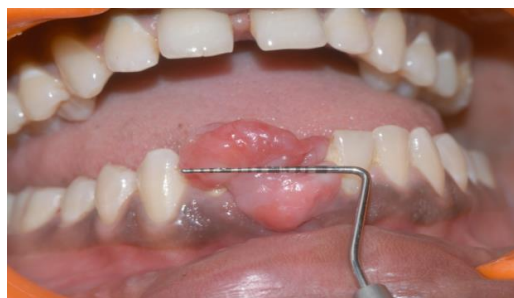
Fig. 2: Horizontal measurement