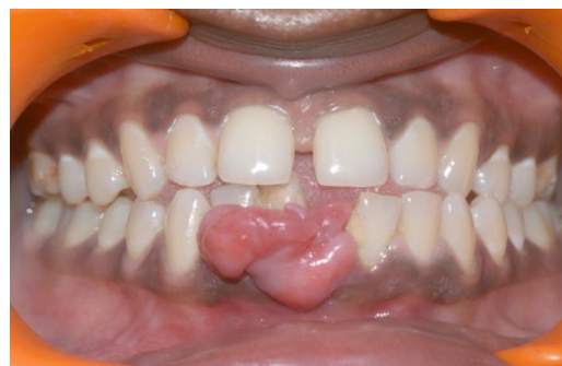
Fig. 1: Gingival enlargement in lower anterior region

Color was pale pink with smooth surfaces and well defined edges. Pathologic migration of 31 and 41 was present. On palpation, swelling was non-tender, sessile and firm in consistency.