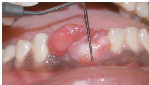
Fig. 3: Vertical measurement